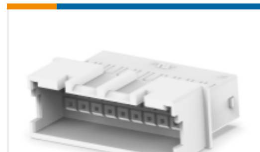
TE Part # 1-2324582-8 HSG,REC,FREE-HANGING,DUALROW, EP2.5