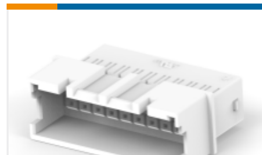
TE Part # 2-2324582-0 HSG,REC,FREE-HANGING,DUALROW, EP2.5